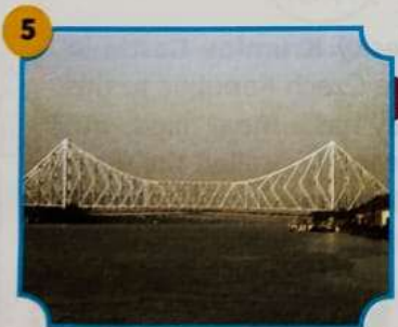
Bridge : _____ Location : Kolkata, India