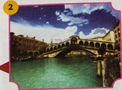
Bridge : _____ Location : Venice, Italy