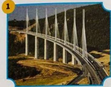
Bridge : _____ Location : Milau, France

Many bridges are popular landmarks of different places in the world. Identify these famous bridges using the pictures and location as clues.