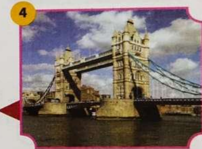
Bridge : _____ Location : London, UK