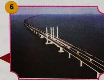
Bridge : _____ Location : Beijing, Sanghai Highway, China